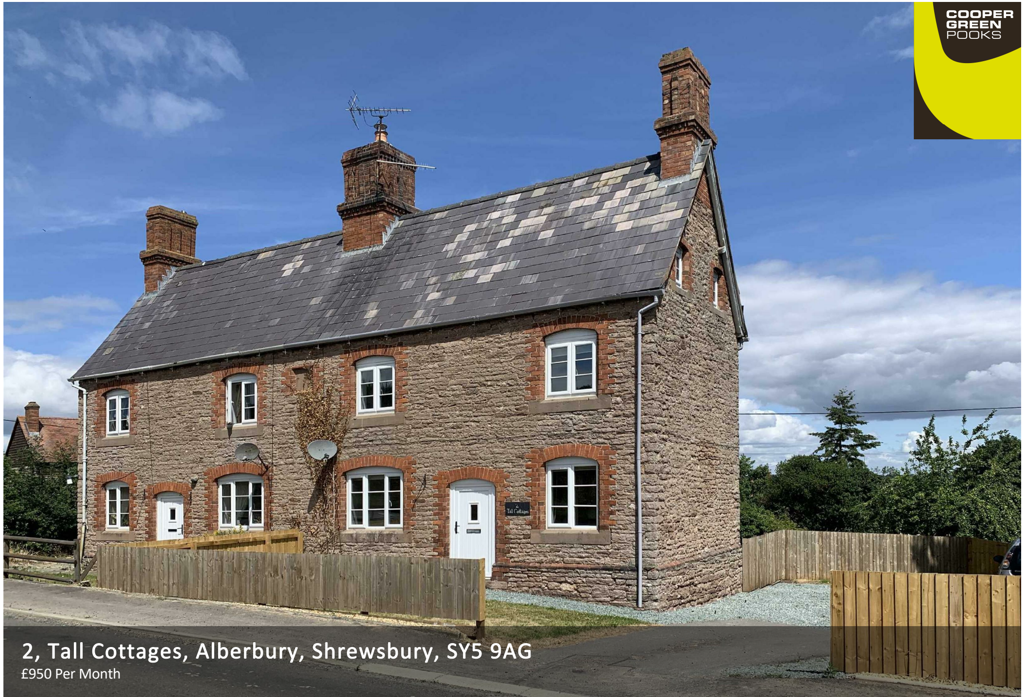
2, Tall Cottages, Alberbury, Shrewsbury, SY5 9AG £950 Per Month